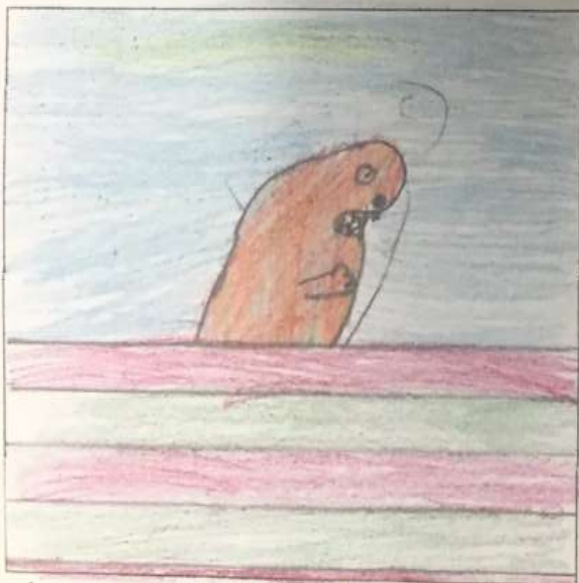
Jack the T-Rex

The quiet hall of St Thomas of Canterbury was given a surprise appearance by Sophie and Jack, the tyrannosaurus Rex's! On Tuesday, the 1 st of November Year 6 were was interrupted by the arrival of Jack. Jack is a baby dinosaur, he is eight weeks old. Jack was trying eat his box! Year 6 said bye to Jack as he roared in the distance.