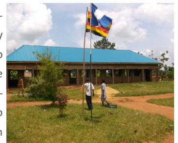
New classrooms at Busenya School

Since then we have funded and helped organise the installation of a much needed water bore-hole, a playground for the children and cooking facilities to ensure that every child has a hot meal each day.