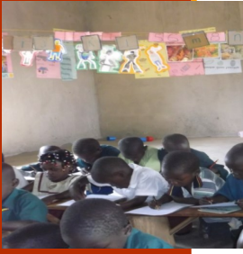
Children at Busenya School