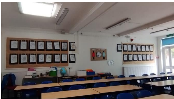
St Louise's Classroom