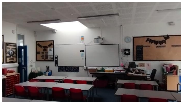
St Mary's Classroom