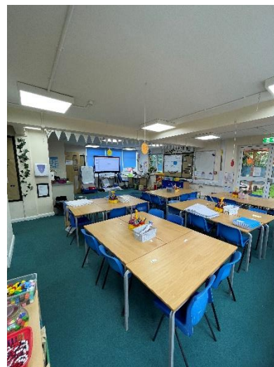
St Theodore's Class