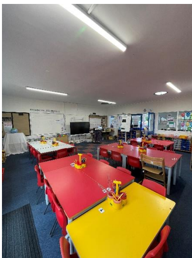
St Rose's Class