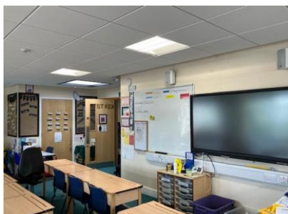
St Kea's Classroom