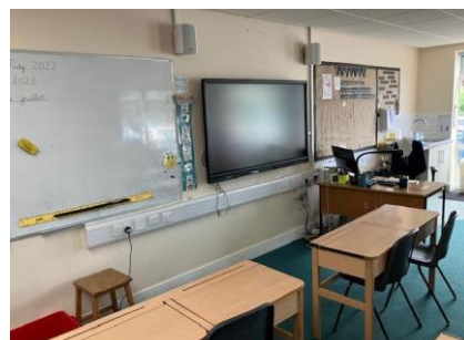
St Philippa's Classroom