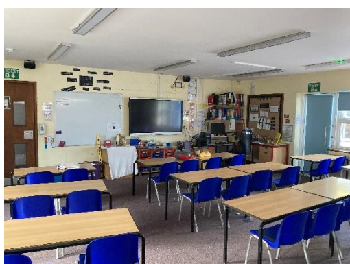
St Wilfred's Classroom