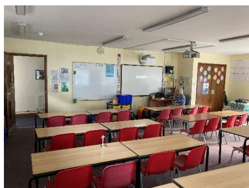
St Gemma's Classroom