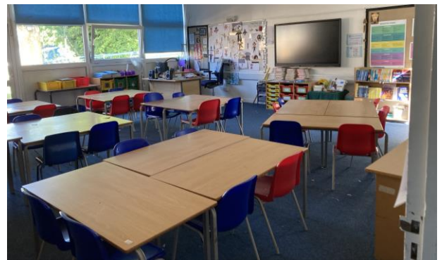
St Martha's classroom