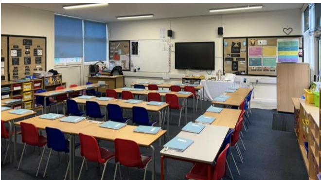
St. Dominic's Classroom